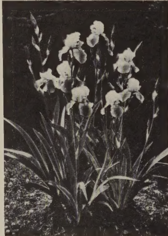
BLUE RHYTHM A cornflower blue on a superb stalk